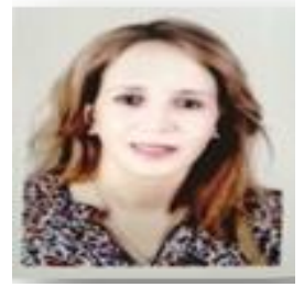
Besma Ghali President of chamber Court of Accounts of Tunisia

Covid-19, or what was classified as a pandemic or a global epidemic led to the contraction of world economics and the paralyze of most sectors except for a number of vital activities such as health, security and defense, which poses the difficulty of achieving the equation between the need to maintain Citizen's health and reducing negative impacts on the economic and social level. The action plans and strategies taken by the various governments to confront the pandemic have important financial implications and have necessitated many exceptional decisions to facilitate the undertaking and the completion of public expenditures, which raises many questions that will be addressed and try to answer them through this article. These questions are: