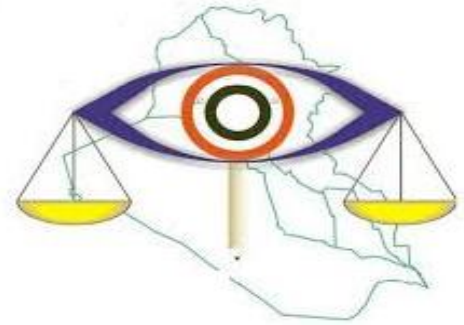
Federal Board of Supreme Audit of Iraq