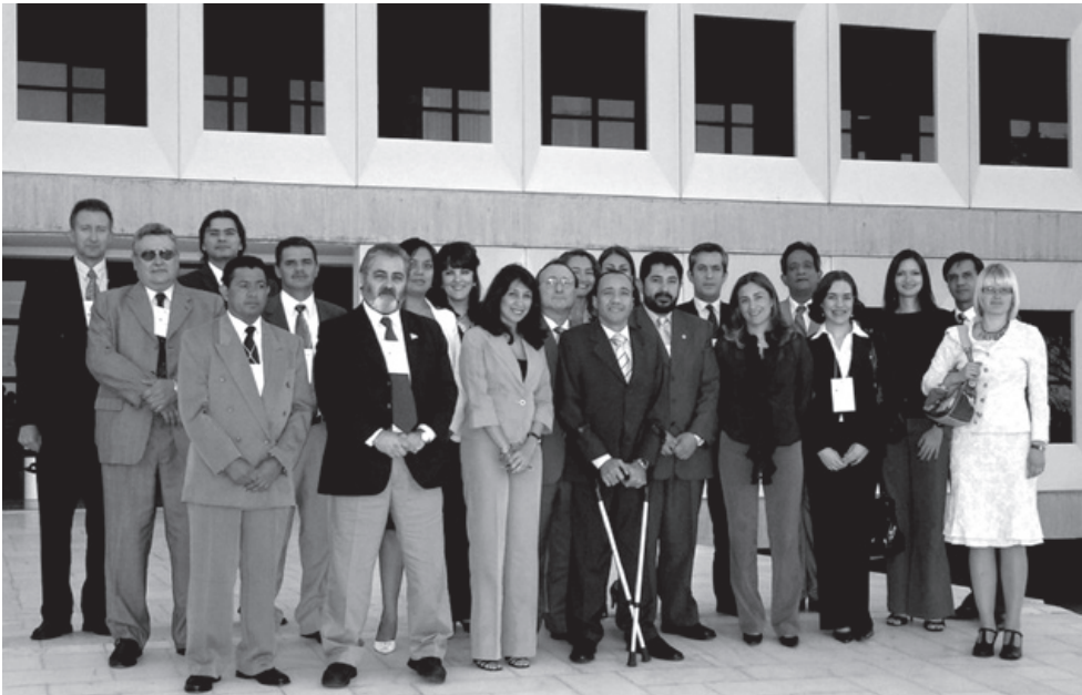
Participants in the OLACEFS Working Group on Environmental Audit meeting in Brazil in June 2008

For additional information, contact the Brazilian Court of Audit: