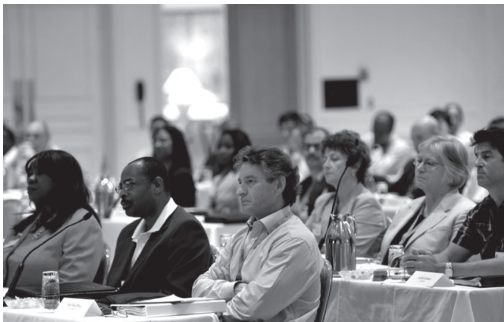
Delegates listen carefully to presentations at the Commonwealth Auditors General Conference

The concluding presentation for this subtheme introduced a research paper prepared by the Overseas Development Institute for the United Kingdom’s National Audit Office. The paper explored the effectiveness of PACs around the Commonwealth and suggested at least three key effectiveness principles: the independence of the PACs, the capacity to avoid questions of policy, and the ability of different parties to work together. A fourth principle emerged from conference discussions—transparency in the work and proceedings of PACs.