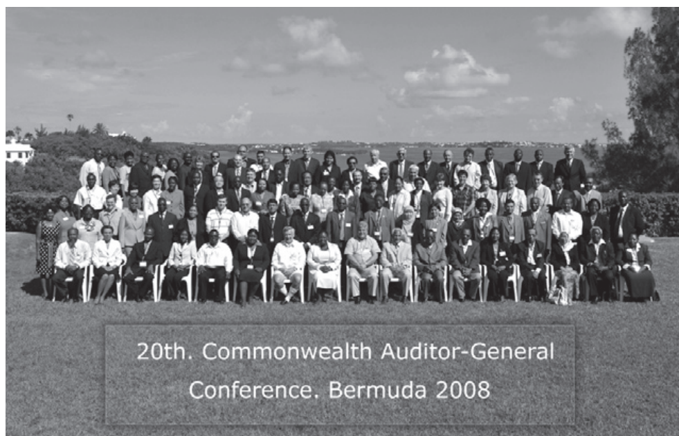
Participants in the Conference of Commonwealth Auditors General in Bermuda in July 2008

More than 45 Commonwealth SAIs were represented at the conference. Participants also included representatives from the United Kingdom Commonwealth Secretariat and observers from the INTOSAI Secretariat General, the Organization of American States (OAS), this Journal , and the Samoan SAI. The conference theme was Accountability for the 21st Century, and participants considered two primary topics under this theme: the powers and responsibilities of Commonwealth auditors general and supporting the scrutiny functions of parliaments and legislatures.