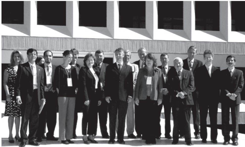
Participants in the Subcommittee on Performance Audit meeting in Brazil in May 2008.

The meeting agenda included presentations by the SAIs of Denmark, Brazil, France, and Australia and by IDI. The Brazilian SAI discussed the results of a mini-survey carried out to determine the audit phases and audit methods or techniques that should be addressed in new performance audit guidelines. The Danish delegates talked about the process for developing standards and guidelines and key Professional Standards Committee initiatives. The French delegate outlined the work of the INTOSAI Program Evaluation Working Group and how this work will relate to the PAS in the future. The Australian SAI described performance audit issues that are important in Australia and relevant to PAS. The IDI delegate addressed the current performance audit scenarios in different INTOSAI regions and related IDI strategies and actions.