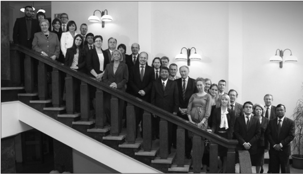
Participants in the April 2012 Subcommittee on Internal Controls meeting in Warsaw, Poland.

The Supreme Audit Office of Poland, which has chaired the subcommittee since the latest INCOSAI in November 2010, hosted the meeting. Representatives from the SAIs of 14 countries (Austria, Belgium, Bangladesh, Brazil, Chile, France, Georgia, Hungary, Lithuania, the Netherlands, Oman, Romania, Russia, and South Africa) attended the meeting, along with representatives of two organizations that have been cooperating with the subcommittee—the Institute of Internal Auditors (IIA) and the Committee of Sponsoring Organizations of the Treadway Commission (COSO).