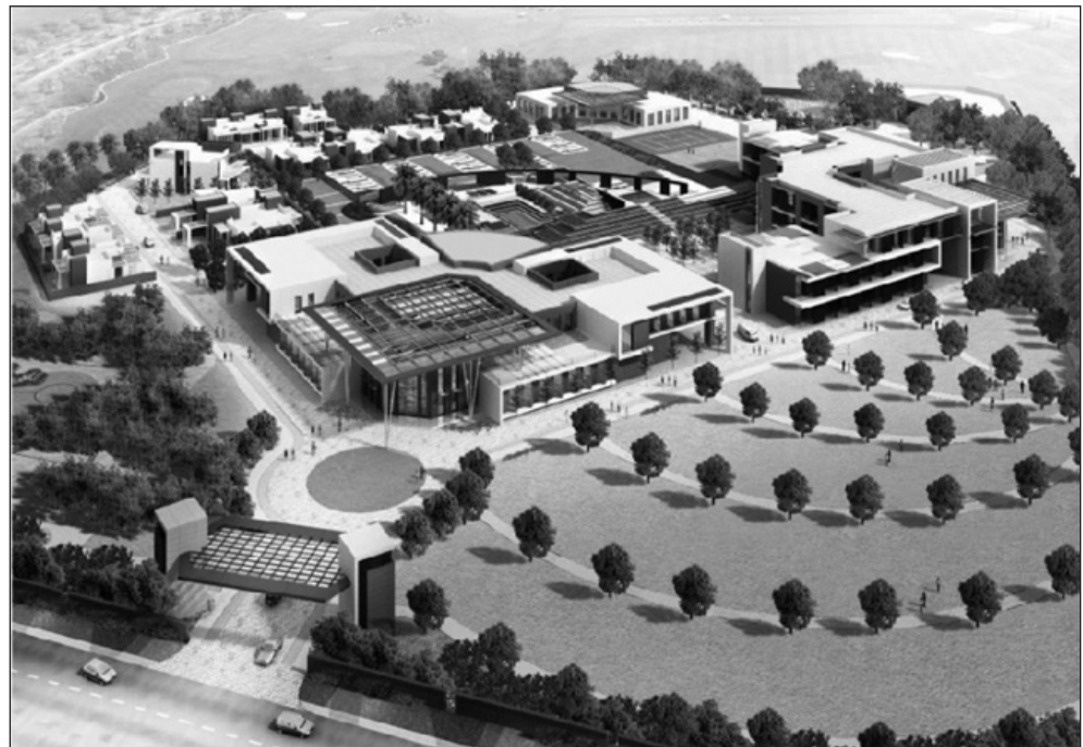
Model Showing Proposed Layout of the iCED

The need for an environmental audit training course for auditors, especially those undertaking environmental audits for the first time, has emerged repeatedly at several WGEA forums. Also, triennial environmental audit surveys of SAIs conducted by the WGEA have pointed out the need for such courses. In response, the WGEA, in partnership with the SAI of India, has decided to set up the International Center for Environmental Audit and Sustainable Development (iCED), a global training facility for environmental auditing to be located at Jaipur, approximately 250 kilometers from New Delhi, the capital of India. The first training is expected to take place in 2013.