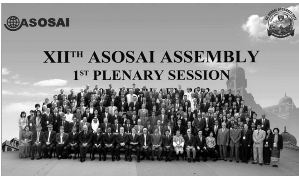
Participants in the 12th ASOSAI Assembly.

Capacity-building programs have been offered to member SAIs, including three ASOSAI-sponsored workshops on performance, environmental, and public debt auditing. IDI-ASOSAI cooperation launched two programs: Quality Assurance in Performance Audit in 2010 and Development and Implementation of the Strategic Plan in 2011. As of the assembly date, two workshops had been organized for each program.