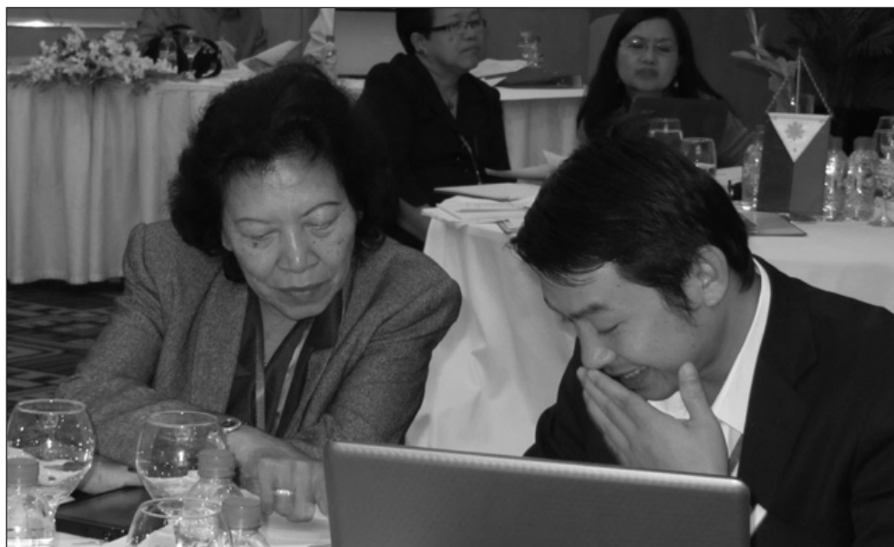
Members of the Laotian SAI took part in the Needs Assessment Workshop of the IDI/ASOSAI Strategic Planning Program.

In ASOSAI, the seven participating SAIs gathered for the Needs Assessment Workshop at the beginning of April. Following this workshop, the SAIs are to conduct needs assessments in their respective institutions that will later be presented for expert and peer review. After conducting needs assessments, the SAIs will reconvene for the Strategic Planning Workshop in September 2012.