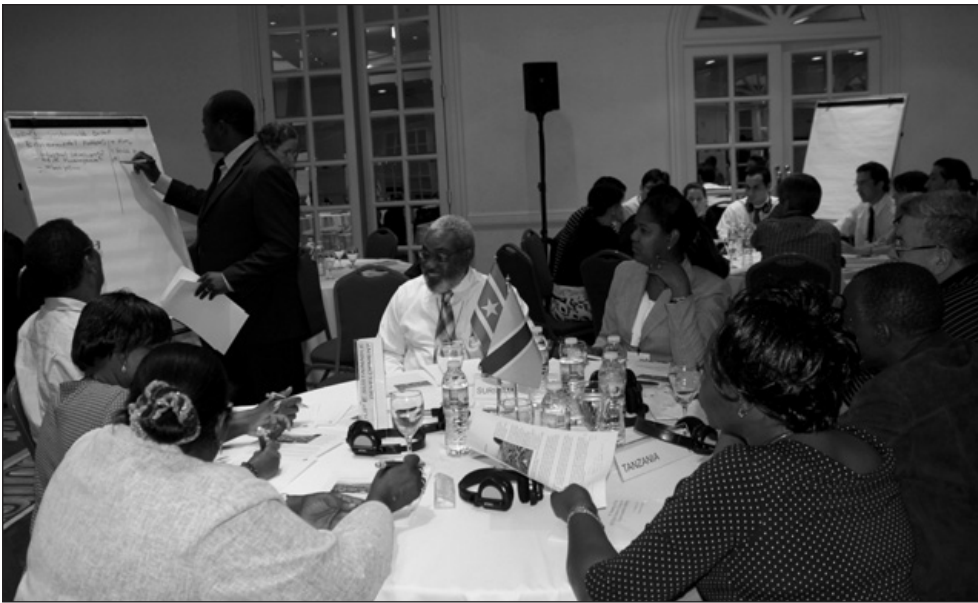
The WGEA's meetings provide training to develop environmental auditing capacity in the participating SAIs.

At the same time, as governments increasingly looked beyond their own borders to solve environmental problems, SAIs too saw the value in cooperating with each other to examine environmental and sustainability issues at the regional, and even global, level. A key milestone along this path took place at the WGEA's April 2000 meeting in Cape Town, South Africa. Reflecting a desire among many SAIs to promote environmental auditing through regional cooperation, the 22 members present voted to support the development and growth of regional Working Groups on Environmental Auditing (RWGEA) while retaining the global working group to support the regional efforts through training, exploratory studies, and other methods.