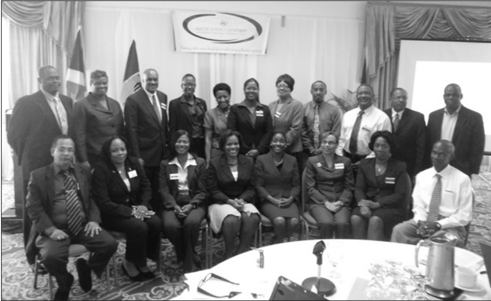
Participants in the CAROSAI strategic planning meeting in Jamaica.

The meeting was sponsored by the Inter-American Development Bank's PRODEV program and the INTOSAI Development Initiative (IDI).