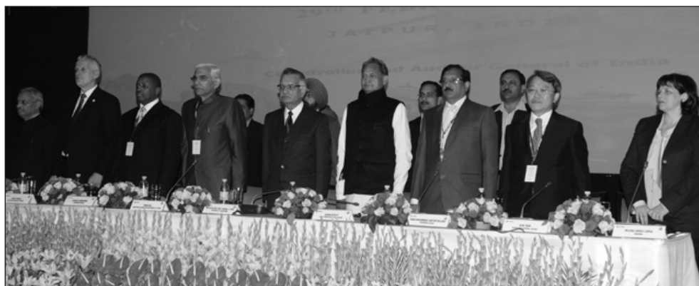
Dignitaries and officials participating in the opening ceremony of the 12th ASOSAI Assembly.

The triennial assembly began with an opening ceremony featuring remarks from the governor and chief minister of Rajasthan; Vinod Rai, Comptroller and Auditor General of India and incoming ASOSAI chair; and Muhammad Akhtar Buland Rana, outgoing ASOSAI chair and Auditor-General of Pakistan, as well as reports of activities since the previous meeting.