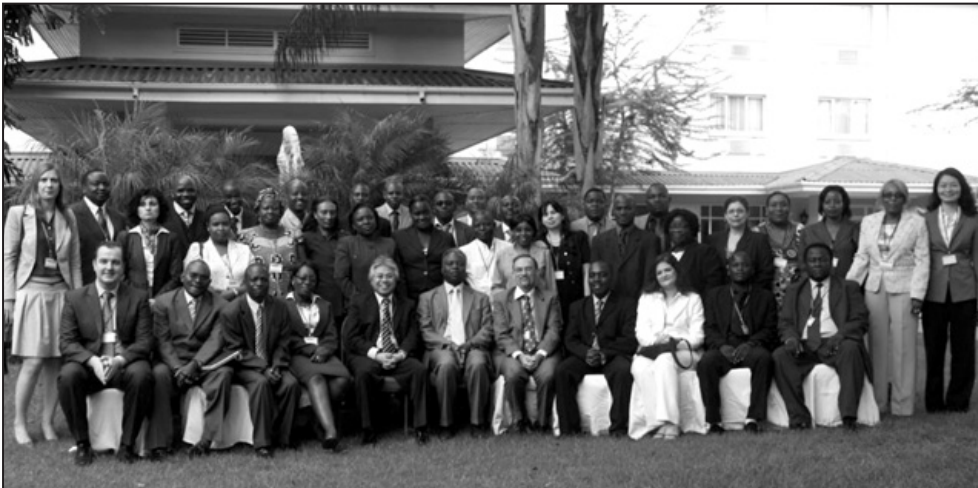
Participants in the audit review meeting held in Lusaka, Zambia, in March 2011 as part of the Transregional Program for Public Debt Management Audit.

gives them a deeper understanding of the public debt management systems of their countries. Wrap-up and exit meetings for this program will be conducted toward the end of 2011 to finalize program outputs and discuss lessons learned and the way forward.