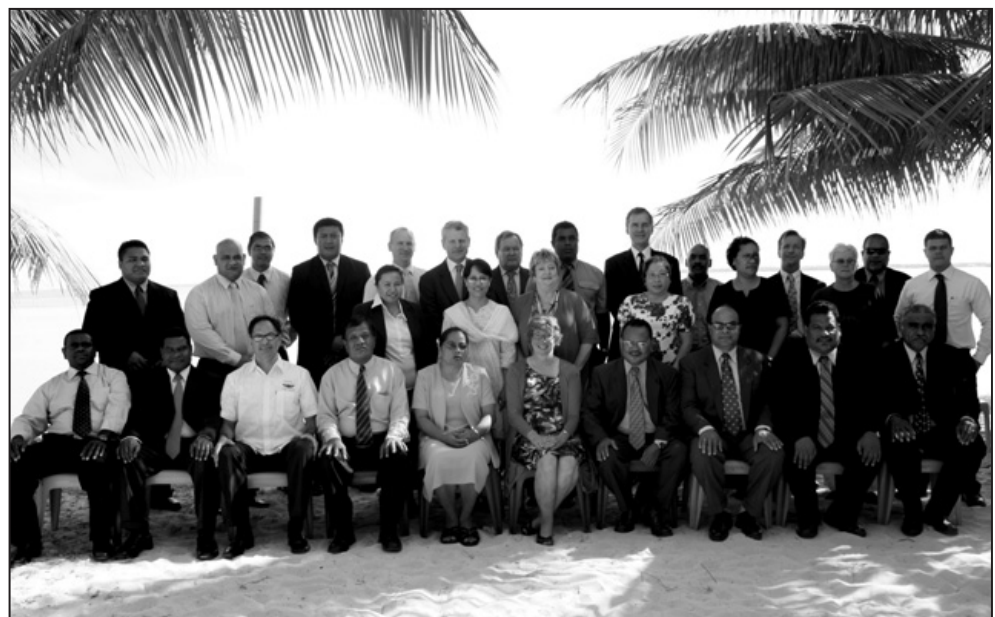
Participants at the 13th PASAI congress in Kiribati.