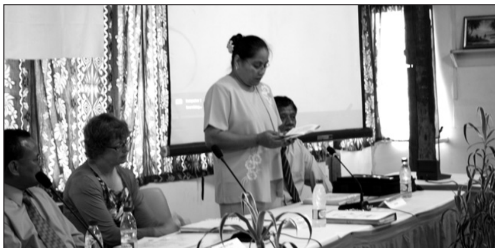
The Vice President of Kiribati, the Honorable Teima Onorio, gave the keynote address at the 13th PASAI congress.

She acknowledged the good work that PASAI has spearheaded under the Pacific Regional Audit Initiative (PRAI), particularly the pooling of resources to address common objectives, such as the Sub-regional Audit Support (SAS) program. Ms. Onorio also acknowledged the continuing support of PASAI’s development partners.